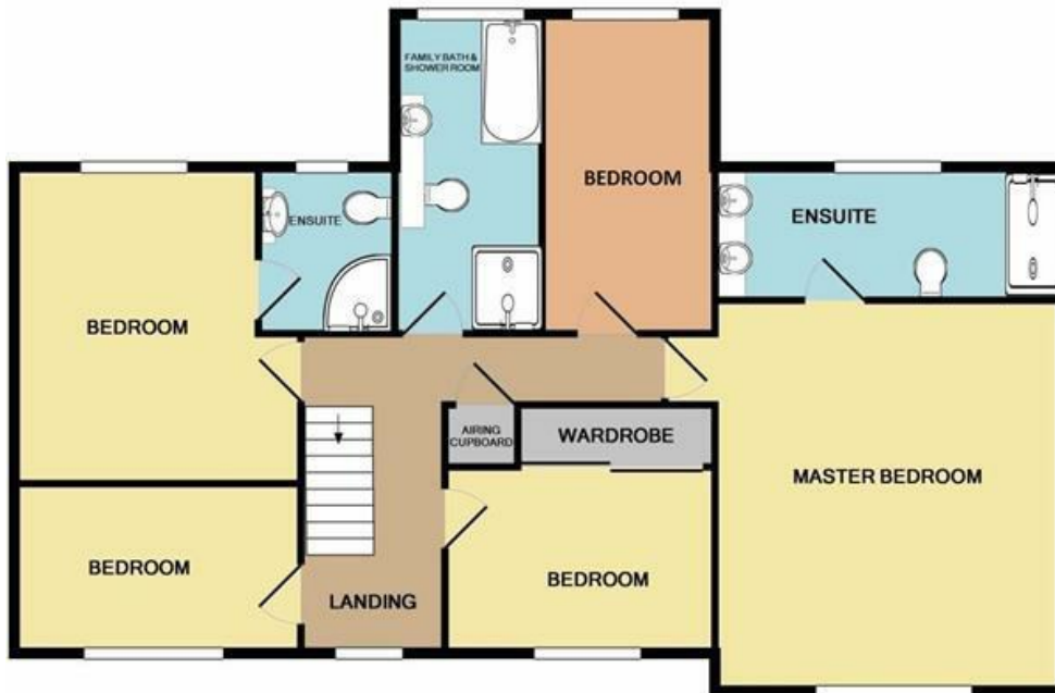
1ST FLOOR APPROX. FLOOR AREA 1071 SQ.FT. (99.5 SQ.M.)

TOTAL APPROX. FLOOR AREA 2368 SQ.FT. (219.9 SQ.M.)